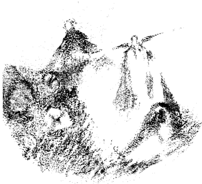
In this pastel sketch by Rudolf Steiner, the working of cosmic forces into the still heavy and mist-laden atmosphere of Atlantis is shown as guided by god-like angelic beings. Out of the downward streaming colours are born the types of the lion, cow, and bird (left), while to the right a kind of cave unfolds inner life and form. (Preliminary sketch for the large cupola of the Goetheanum ceiling, Dornach, Switzerland).

matured in order to develop an inner consciousness of self. At length, the fourth age arrived. At this stage something of tremendous importance took place, which had been prepared by all that had previously happened.